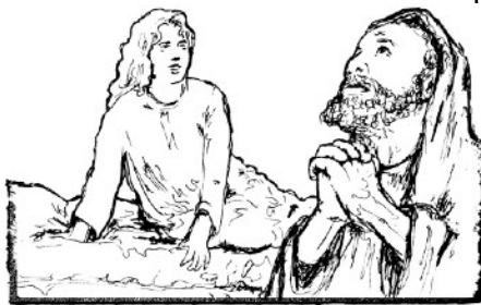
Tabitha Raised From the Dead

Tabitha was a disciple in the city of Joppa. "She was devoted to good works and acts of charity" (Acts 9:36b). Widows wept and Peter traveled to mourn the death of this woman mentioned in Acts. She was not only a believer but also a doer as the mourning widows attested when they showed Peter what she had done for them. We do not know what moved him to do what he did next, but God saw fit to use Peter to raise Tabitha from the dead so that more would believe.